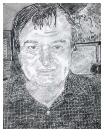
Self Portrait, Pencil on Paper 25cm x 20cm, 2015