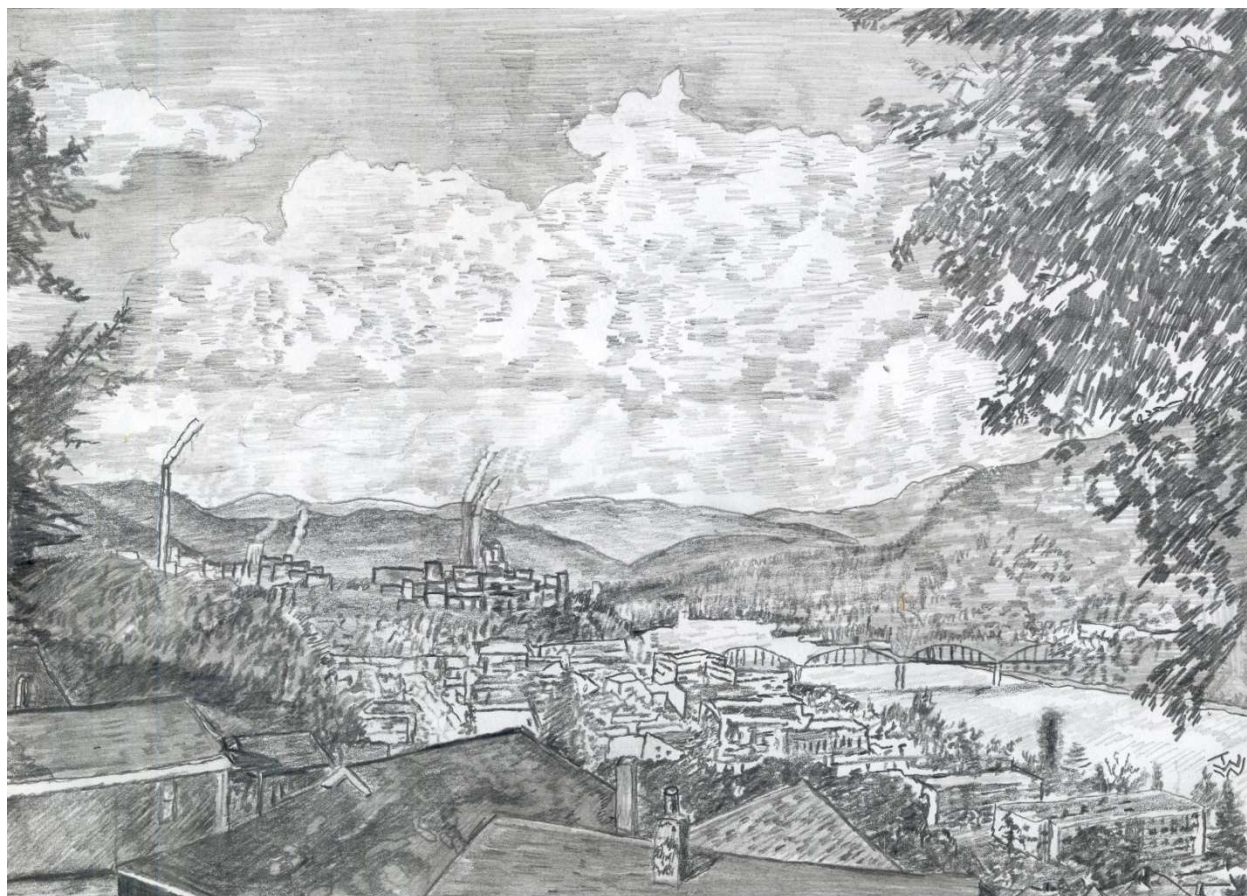
Trail, BC, Pencil on Paper, 24.5cm x 17.5cm, 2016